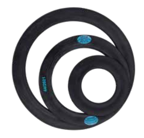
KLINGER KGS GII

Dimensions of standard sheet: 1,500 x 2,000 mm Thickness: 0.5 mm, 1.0 mm, 1.5 mm, 2.0 mm, 3.0 mm Tolerances: Thickness \pm 10%, length \pm 50 mm, width \pm » Highly suitable for plastic and fiberglass flanges 50 mm. Can also be supplied as ring seal gaskets in DIN. ANSI, and user-defined dimensions.